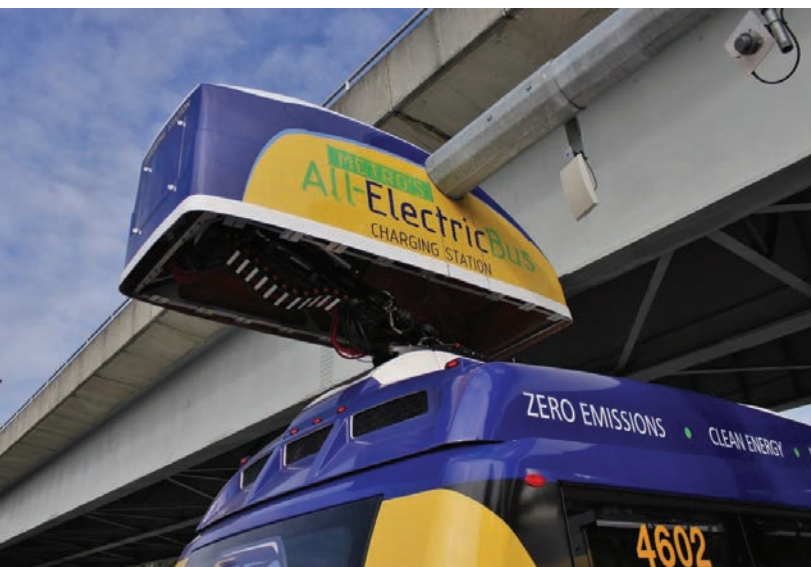
A King County Metro electric bus charging at Eastgate Park & Ride.