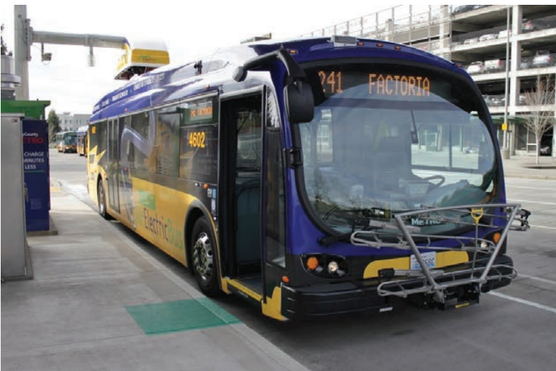
King County Metro electric bus at Eastgate Park & Ride, Bellevue, WA.