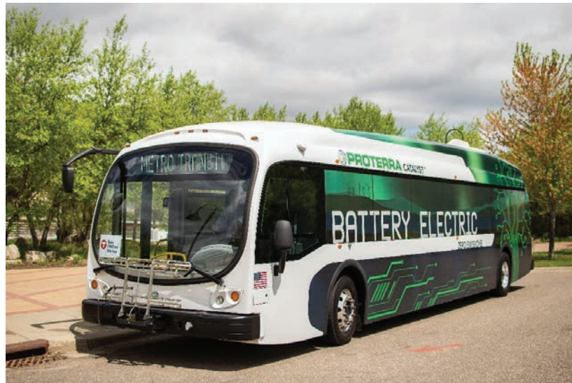
A Minneapolis St. Paul Metro Transit electric bus.