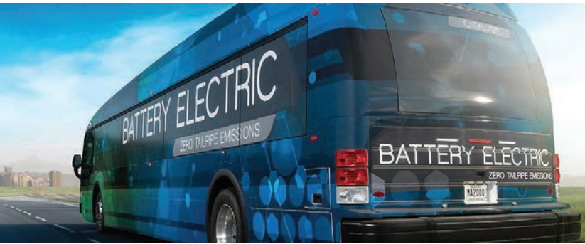
A Proterra Catalyst electric bus.

THE ELECTRIC BUS MARKET in the United States has expanded dramatically over the last five years. There are a total of 528 fully electric, battery-driven buses currently in service across the country – an increase of 29 percent in 2018 alone. 66 Recent pledges by California, New York City and Seattle to transition to zero-emission fleets mean that 33 percent of all transit buses in the U.S. are now committed to go electric by 2045. 67 Roughly 4 percent of all new public transit bus sales in 2018 were electric buses, and 13 percent of the country's transit agencies currently either have electric buses in their fleets or have them on order. 68 Taking into account those that have received grant funding for electric buses but not yet placed orders, upwards of 18 percent of U.S. transit agencies are now making moves toward electric buses. 69 Major players in the market include manufacturers Proterra, BYD Motors and NFI Group, the parent company of New Flyer of America. Companies bringing out electric school bus models include Blue Bird Corporation, Nova Bus Corporation, The Lion Electric Co., Thomas Built