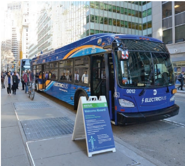
New Flyer electric bus outside MTA Headquarters, New York City, April 2018.