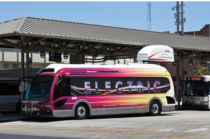
An all-electric Proterra BE35 bus operated by San Joaquin Regional Transit District (RTD), California next to its "Fast Charging" station.

Government funding and other incentives can make electric buses even more affordable. For instance, California's Hybrid and Zero-Emission Truck and Bus Voucher Incentive Project (HVIP) currently offers up to $235,000 for electric school buses sold in the state. 56 A 2016 analysis comparing