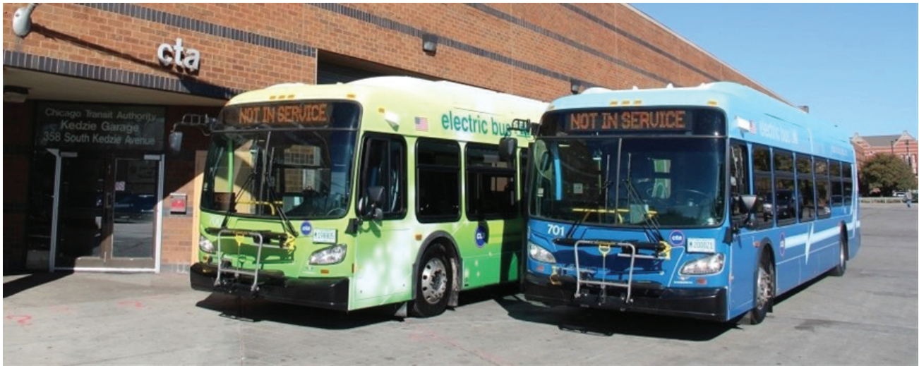
Chicago's first all-electric buses.