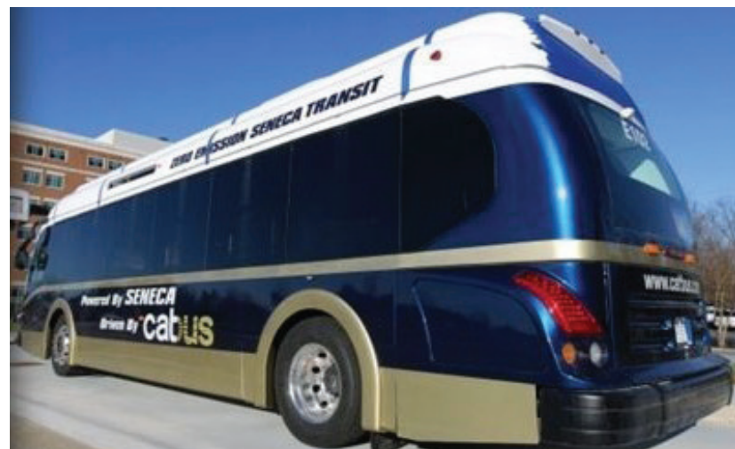
A CAT electric bus.

In 2010, the City of Seneca partnered with CAT, the Center for Transportation and Environment (CTE) and the South Carolina Department of Transportation (SCDOT) to apply for a federal grant from the Low or No Emission Program to develop the first scalable model of an all-electric bus transit system in the U.S. In contrast to other cities, which had to that point only deployed one or two electric buses as “parade buses” in their fleets, Seneca intended from the start to convert the entire operation to all-electric