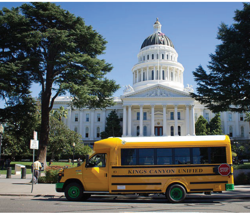
The first all-electric school bus in California, outside the California capitol building in Sacramento in 2014.