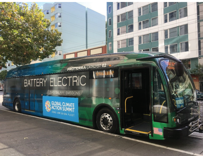
A Proterra electric bus.

Electric buses produce significantly less carbon pollution than diesel-powered buses,